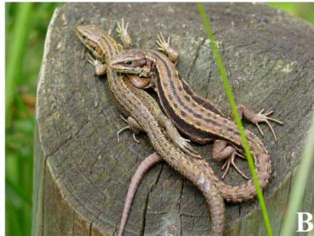
Fig. 3. a) Juvenile adder Vipera berus (~14 cm in length), recently emerged from hibernation, found under a refugium mat, 22 March 2012. b) Common lizards Zootoca vivipara (~13 cm), 17 August 2012.