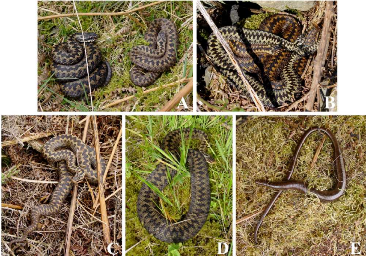
Fig. 2. a) Male and female adders Vipera berus (~40 cm in length), recently emerged from hibernation, 31 March 2012. b) Mating male and female adders (both ~60 cm), 15 April 2012. c) Gravid female adder (~60 cm), 22 April 2012. d) Gravid female adder (~60 cm) in a flattened posture to maximise absorbance of solar radiation, 20 June 2012. e) Gravid female slow-worm Anguis fragilis (~25 cm) found under a refugia mat, 25 August 2012.

but transiently at new locations, indicating that they were wandering. Males and small females reappeared in numbers in mid September at hibernacula, sunning for long periods, with the last seen on 21 October.